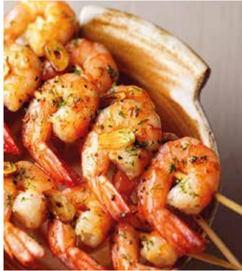
Garlic & Herb Marinade