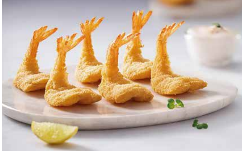
Flat Breaded Shrimp