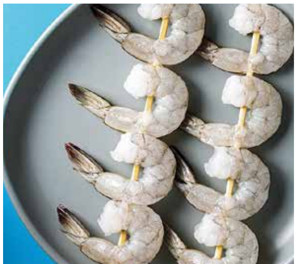
Raw Peeled & Deveined Tail On Skewers