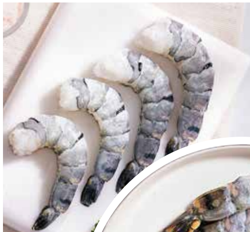
Peeled & Deveined Tail Off