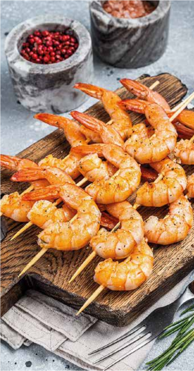
Sweet Chilli Marinade