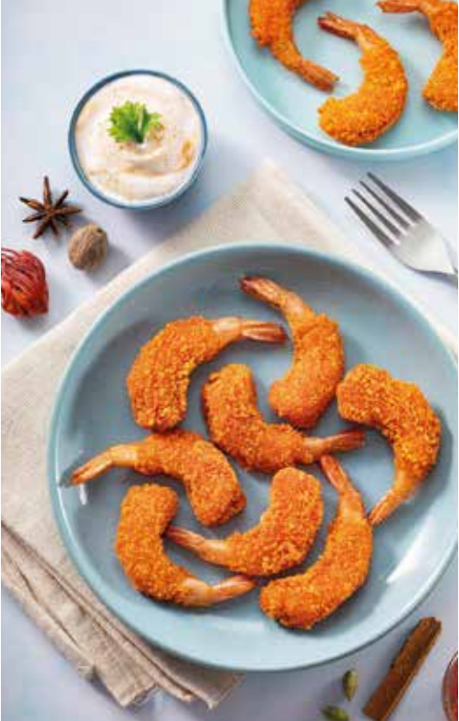
Hot & Spicy Shrimp