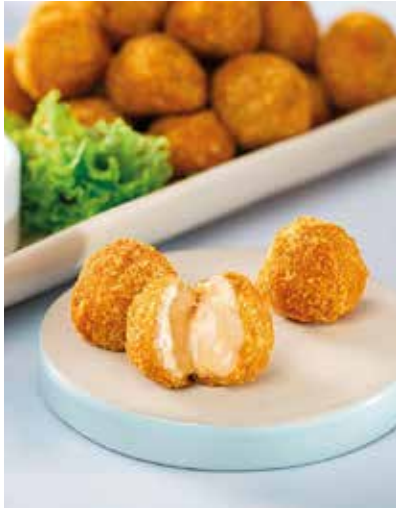
Cheese Stuffed Shrimp Balls