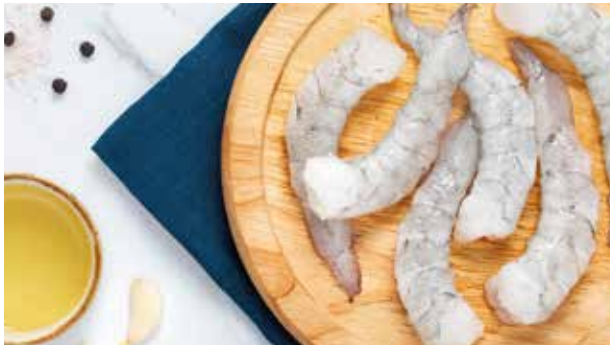
Peeled & Deveined Tail Off