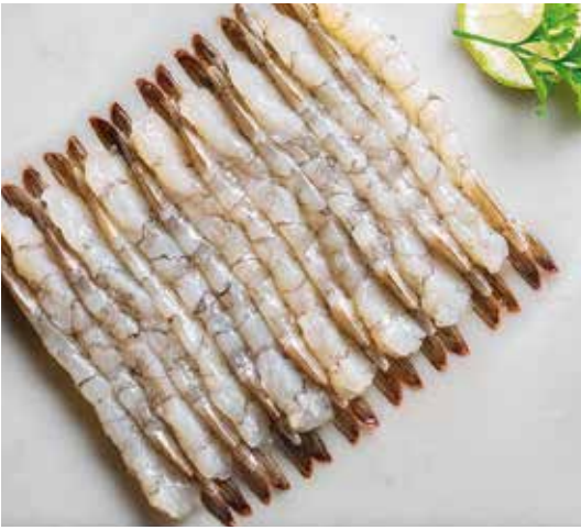
Raw Nobashi Shrimp