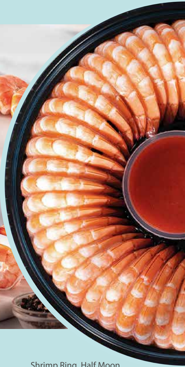
Shrimp Ring, Half Moon