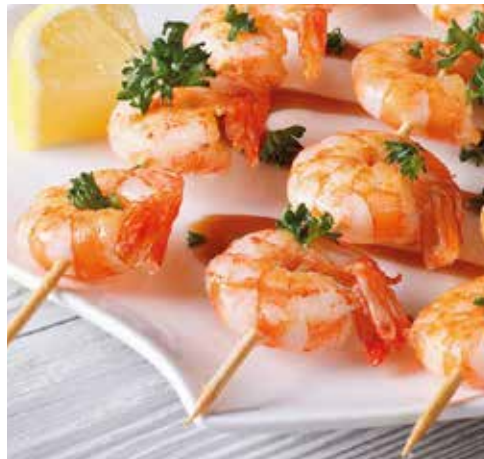
Citrus Lemon Marinade