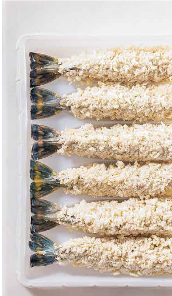
Breaded Raw Shrimp Ebi with Tray

However, we also accommodate custom products and packaging based on customer-specific requirements upon request.