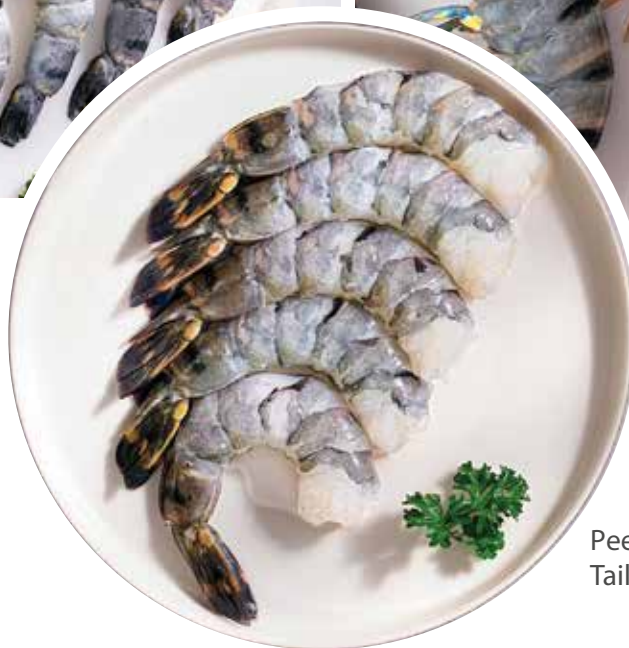
Peeled & Deveined Tail On