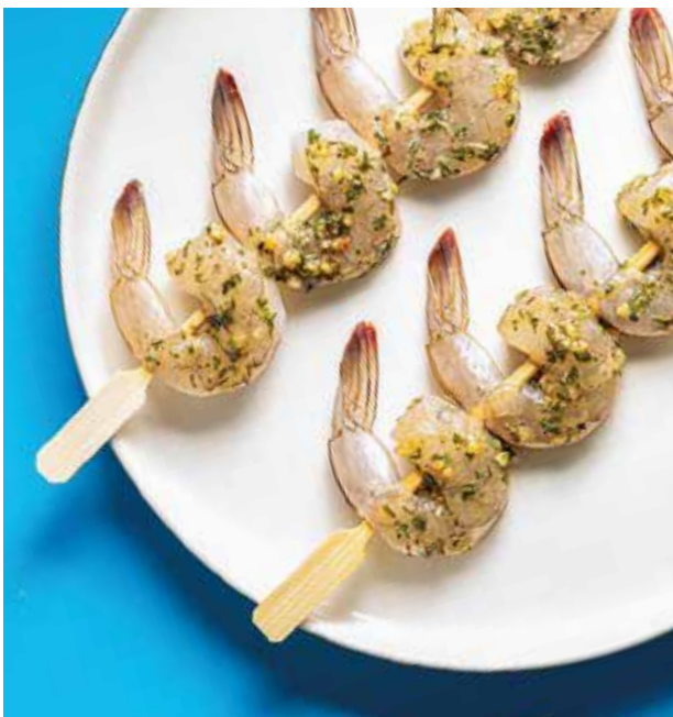
Marinated Skewers with Customised Flavoring