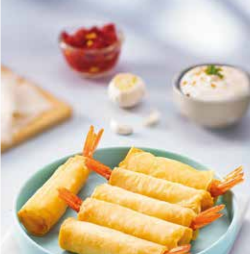
Filo Pastry Shrimp